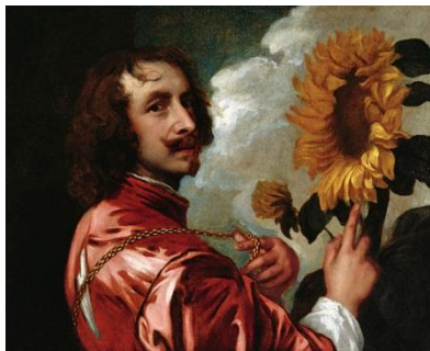
Figure 1. Self-portrait by Anthony van Dyke, after whom the Van Dyke beard is named.