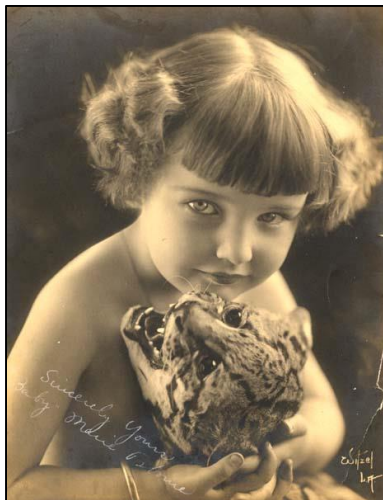
Figure 3. "Baby" Marie Osborne